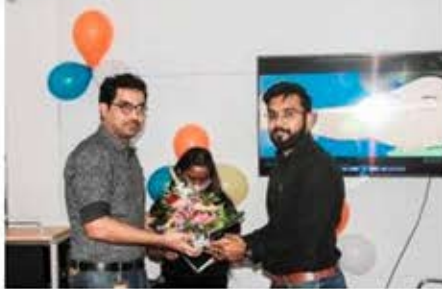
अलीकडे भरती मोहीम संपन्न झाली आहे एरीना अॅनिमेशन.

कोरोना महामारीने अनेक क्षेत्रांचा पराका असा प्रभाव होत आहे अनेक क्षेत्रांचे रोजगार गिरे पडत आहे अशा पहाव्याने आहे हे नुकता वेळून एरीना अॅनिमेशन टिक्क रस्ता येथे भरती मोहीम संपन्न झाली आहे. एरीना अॅनिमेशन यांनी मुंबईत भरती मोहीम राबविताना अलीकडे येथे भरती मोहीम संपन्न झाली आहे. एरीना अॅनिमेशन यांनी मुंबईत भरती मोहीम राबविताना अलीकडे येथे भरती मोहीम संपन्न झाली आहे. एरीना अॅनिमेशन यांनी मुंबईत भरती मोहीम राबविताना अलीकडे येथे भरती मोहीम संपन्न झाली आहे.